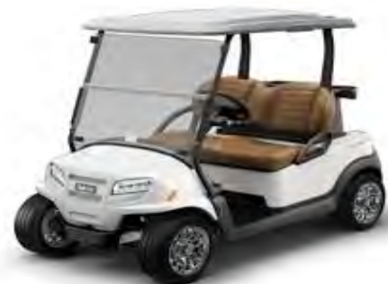
2022 Club Car Onward