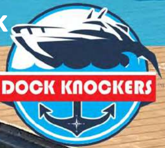
EMERALD BAY BOAT RAMP

DOCK KNOCKERS ARE ONE OF THE MOST VERSATILE DOCK CUSHIONS ON THE MARKET TODAY.